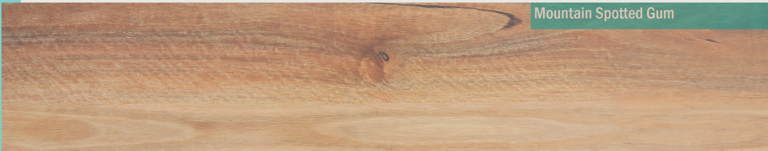
Mountain Spotted Gum